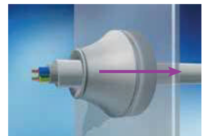
The grommet is then locked in position by pulling it back.