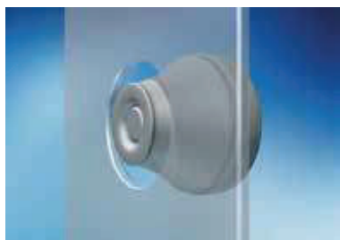
Push the grommet into the hole.

Suits material thickness 0.5 - 4mm both in plastic and metal