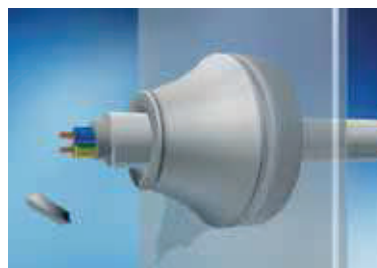
Pierce the grommet with the cable.