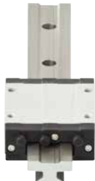
Complete system online