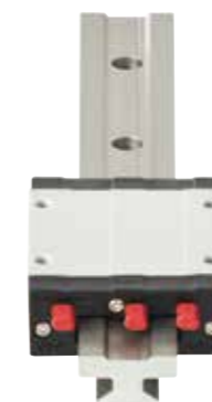
Complete system online