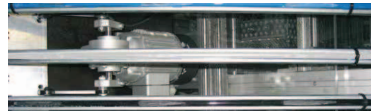
igus® material abrasion test

Delivery time 24h or today. Delivery time means time until shipping of goods.