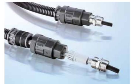
PMA EMC System providing electro-magnetic shielding.