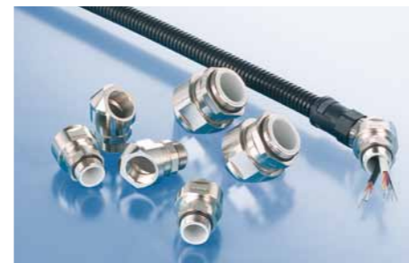
Accessories: Wide range available.