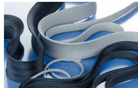
Braids F.66, C.66, L.66, F.PX, L.PX, G.PX for simple bundling and abrasion protection for cables and wires.