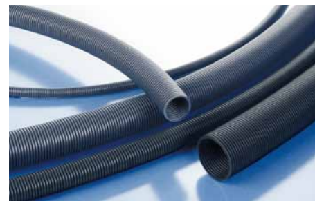
Conduits: PLR (PA6) and PCSL (PA12) conduits with high-grade, specially formulated polyamide. Very good flammability characteristics and mechanical performance.