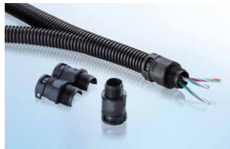
PMA Divisible System for retrofit and repairs.