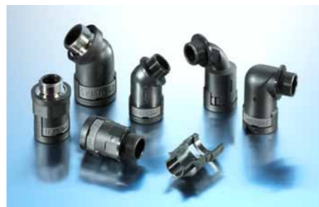
Fittings: PMAFIX IP68GT single piece fittings with integrated strain relief optimally holds and seals cables.